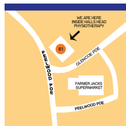
81 Glencoe Parade Halls Head, WA