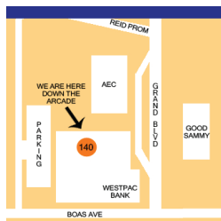
Suite 10 / 140 Grand Blvd Joondalup, WA