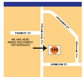
149 Spencer Street Bunbury, WA